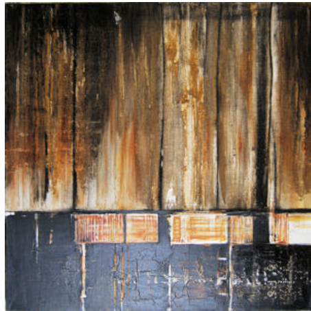
Jen Mallinson 'Kinchega Gateway' mixed media 450 x 450cm