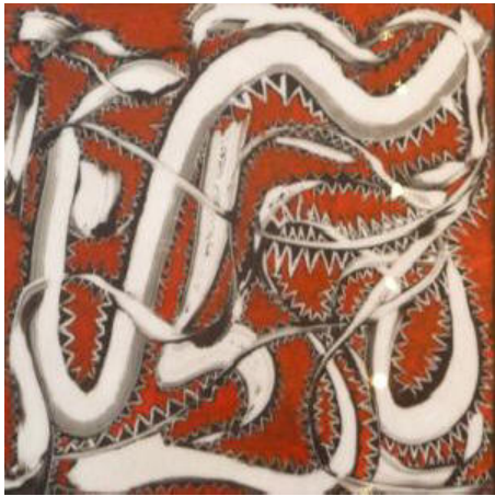
Craig Cameron 'Art Deco 1' paint and perspex 450 x 450cm