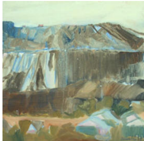
Susan Chancellor 'Broken Hill' oil on canvas 450 x 450cm