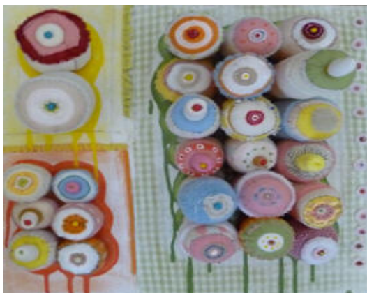
Matthew Jones 'Pleasant Recollections of a Drowning Cartographer' textile, acrylic, plastic, latex 450x 450cm