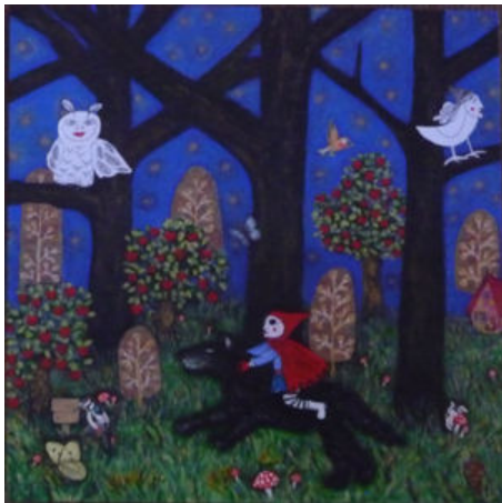
Sam Bailey 'Not that kind of Girl' mixed media 450 x 450cm